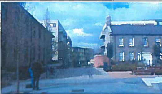
Guided tour by a colleague around some of