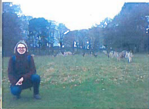
Weekend outing to Phoenix Park