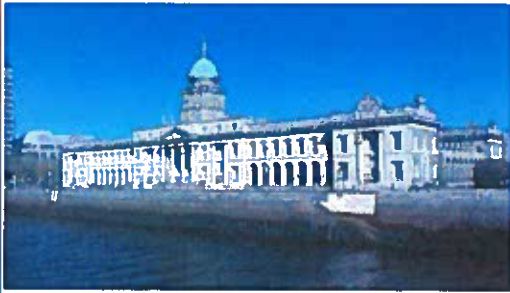
Our workplace – Custom House

Insert any pictures that showcase your experience.