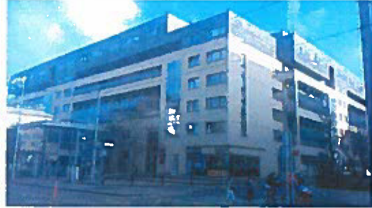
Our accommodation in the city centre