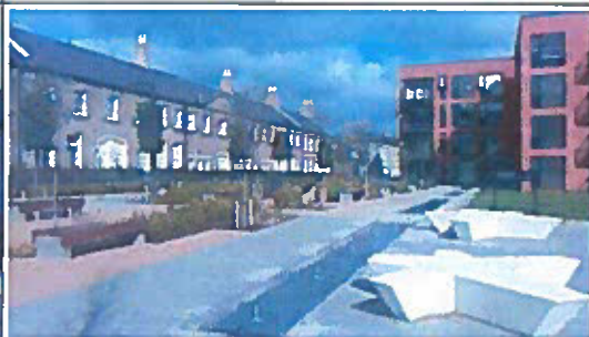
Dublin's regeneration projects